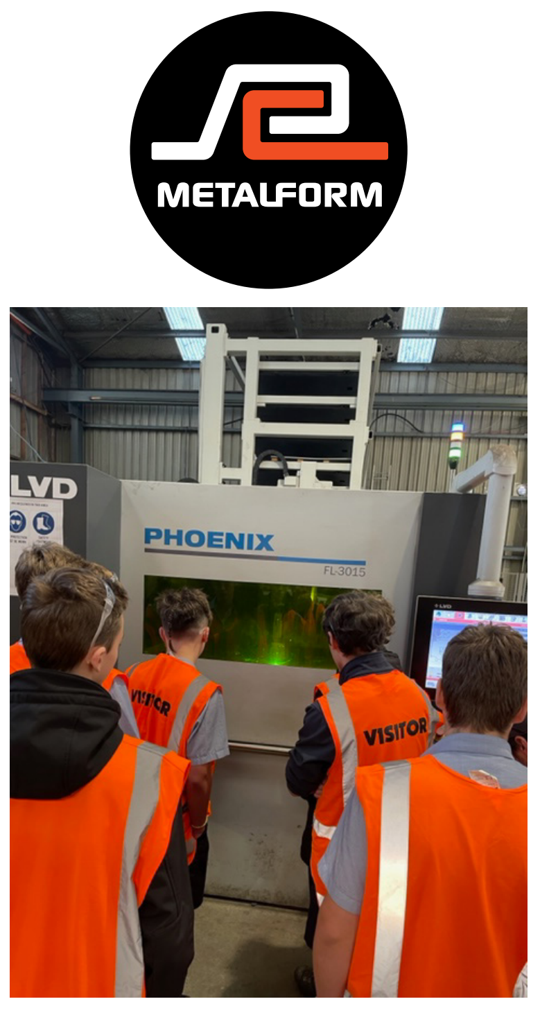
Laser cutter preparing precison parts.

Tararua College has been highly active this year in engaging with Talent Central. Students have enrolled in the WorkReady Course, and this has enabled us to provide driving lessons, industry visits and work experience opportunities. The College owns its own car, and we have provided an extra instructor to utilise their vehicle for the driving lessons. This has worked very well, as students must travel the 40km to Dannevirke to sit their restricted licence. Each Monday we have students driving to Dannevirke and practicing on the routes required for their test. This also provides an opportunity for students to practice on the open road and build up their confidence for driving on rural roads. Businesses in Pahiatua and the surrounding areas have been incredibly supportive of Talent Central's engagement with the College, and have provided industry visits and opportunities for work experience. Students are being offered opportunities for work experience over the school holidays and for the Christmas break. Our thanks go to all the businesses who have engaged.